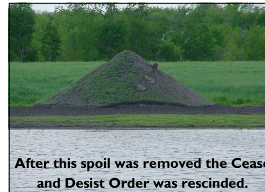
After this spoil was removed the Cease and Desist Order was rescinded.

The order shall state that it will be canceled when the landowner obtains a Certificate of Exemption or no-loss from the LGU, or a certificate that re-