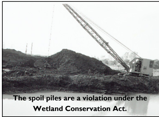
The spoil piles are a violation under the Wetland Conservation Act.

All draining and filling and some excavation activities conducted in wetlands under the jurisdiction of the Wetland Conservation Act (WCA) are subject to administration by the Local Government Unit (LGU). Enforcement of this act is directed by the Department of Natural Resources (DNR) Conservation Officers. Conservation Officers (COs) get involved when they become aware of draining or filling activities in a wetland. This may happen through phone calls from the general public and public agencies or by observing the activity directly. It is the responsibility of the CO to follow up and determine if the activity is a violation.