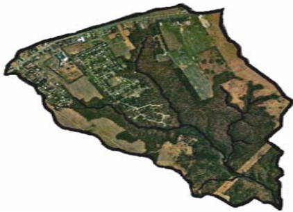
Center for Watershed Protection

Watersheds are areas that drain rain water through streams, ditches, pipes and gutters to lakes and rivers. Rain water carries with it whatever it comes in contact with. Therefore, proper landscape management throughout a watershed is important to the condition of water bodies.