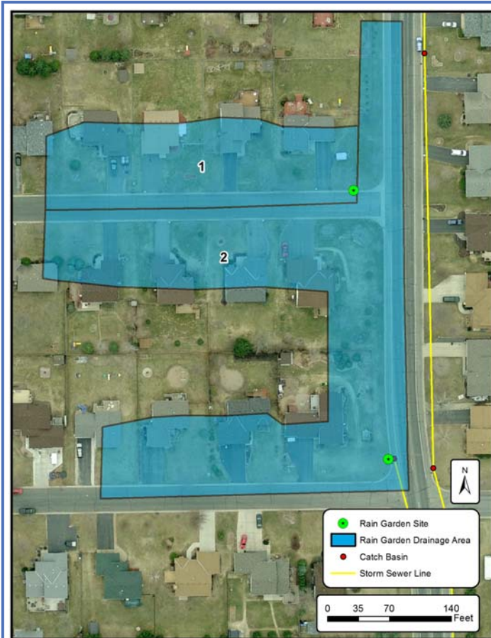
Installed rain garden sites and drainage areas in RL-5.