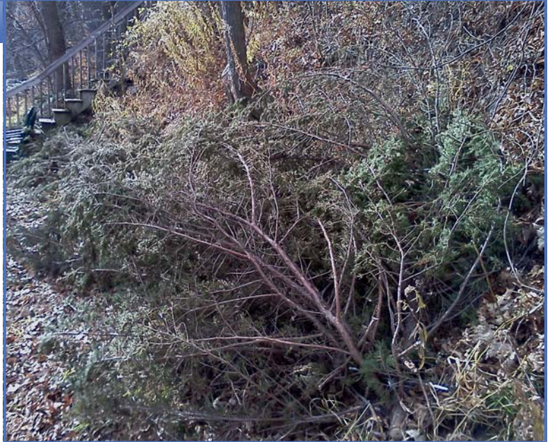
Completed project in the fall of 2011.

Cedar tree revetments are a cost-effective, bioengineering practice that can be used to stabilize actively eroding riverbanks. Anoka Conservation District (ACD) staff installed a cedar tree revetment on a residential property that borders the Rum River in Ramsey during the fall of 2011. Erosion at the property, which was dominated by bank undercutting, was in the beginning stages of creating a more serious issue. Bare soil and tree roots were becoming clearly visible as a result of the erosion. Installation of the 55 foot revetment will slow or stop the erosion and reduce the likelihood of a much larger and more expensive corrective project in the future. Excessive erosion along riverbanks threatens property and associated structures, contributes sediment and nutrients to the receiving water body, and eliminates wildlife habitat. The cedar tree revetment installed as part of this project works to correct these problems. The project was funded through the Lower Rum River WMO (LRRWMO), ACD's water quality cost share program, and landowner contribution.